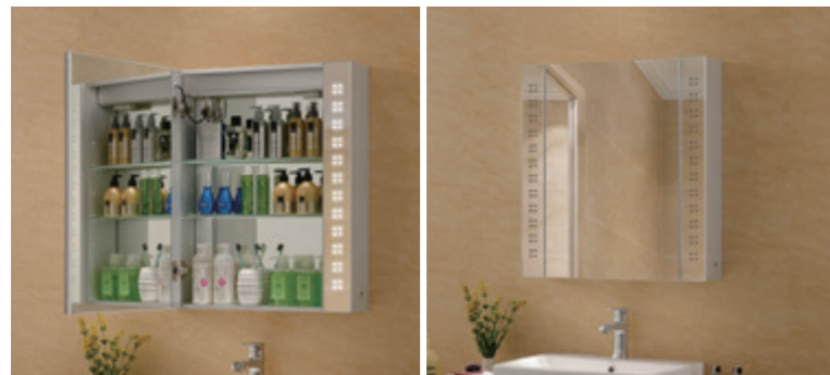
Item No : N-D001 Size:W500mm,H700mm; Or other customized