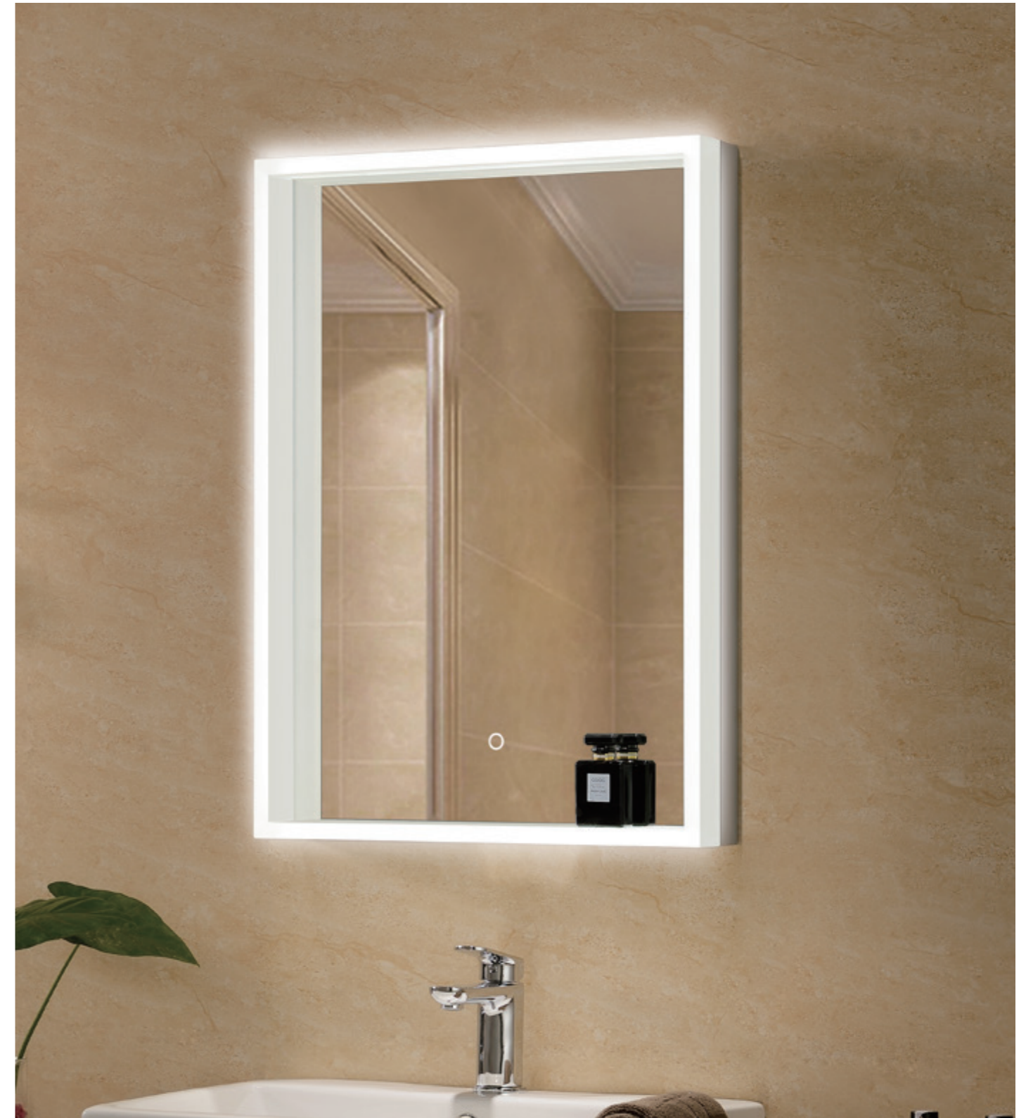
Item No : N-C002