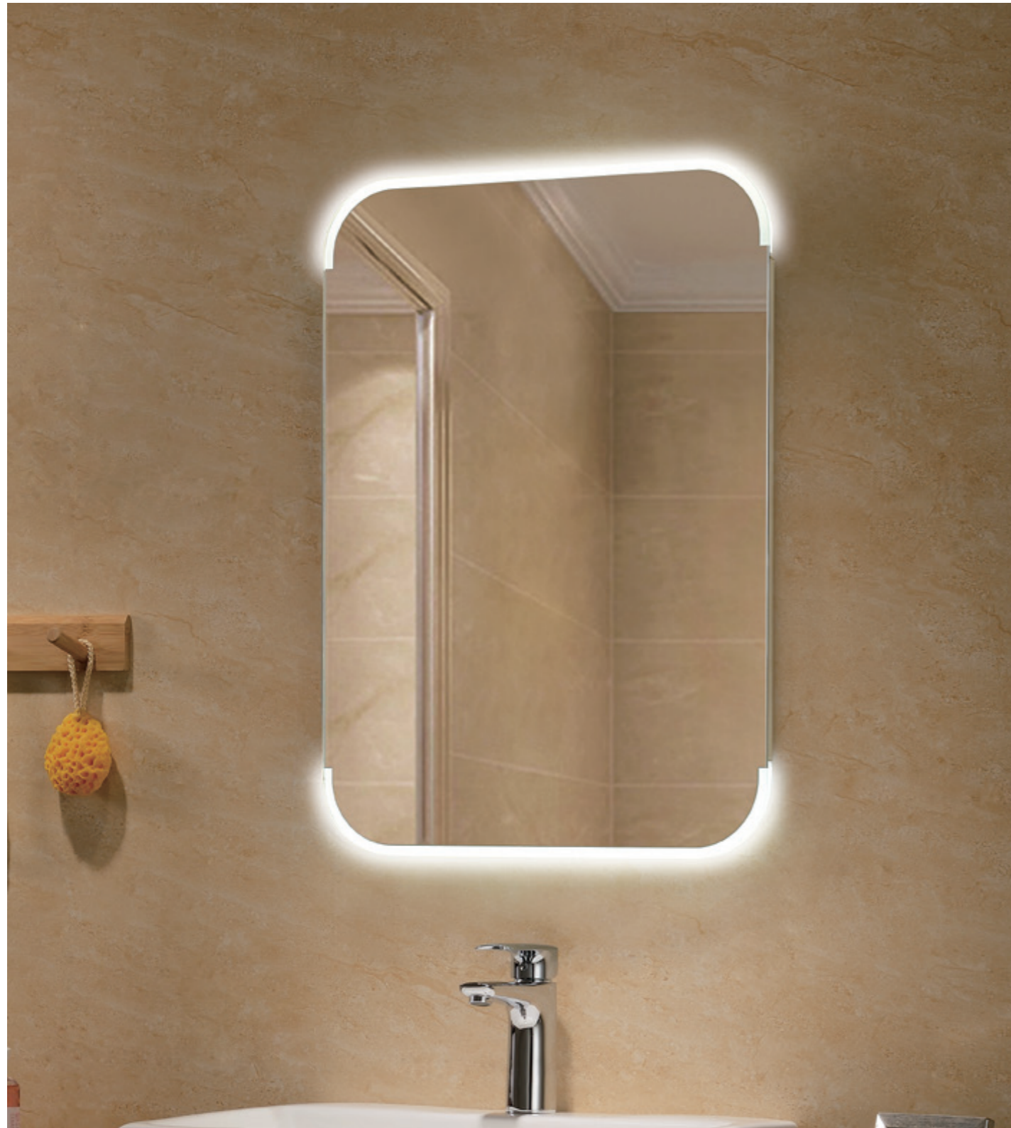
Item No : N-C001